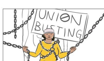
Freedom of association & Rights to organise