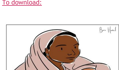
Social security and child care for women workers