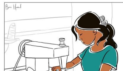
Job and wage security for all