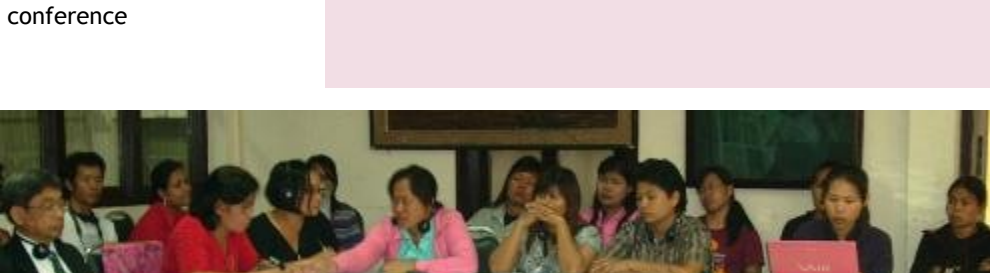
Below: Participants of the conference

In response to the Trade Unions, the Ministry of Labour representative stated that the Ministry is implementing six measures to cope up with current crisis situation.